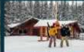
Hinton Nordic Centre, AB