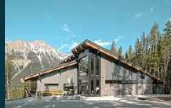
William Watson Lodge