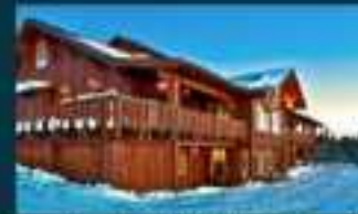
Raven Lodge at Mt Washington BC