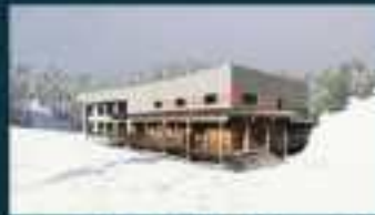
Sovereign Lake Nordic Centre, BC