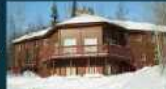
Strathcona Wilderness Centre, AB