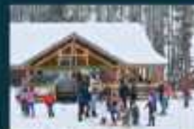
Kimberly Nordic Centre, BC