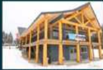
Larch Hills Ski Chalet, Enderby BC