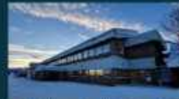
Whitehorse Nordic Centre, YT