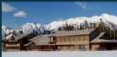
Canmore Nordic Centre, AB