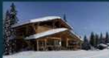
Dawn Mountain, Golden BC