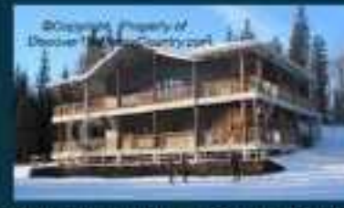
Wapiti Nordic Centre, Grand Prairie AB