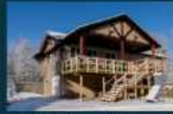
Pembina Nordic Centre, Drayton Valley AB