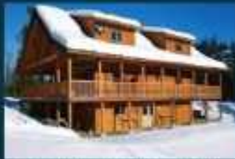
Revelstoke Nordic Centre BC